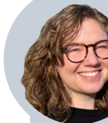
Lexy Doherty US House CD 10